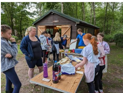
Preparing our buffet lunch