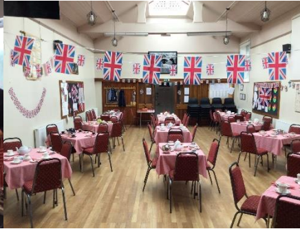
All ready and waiting