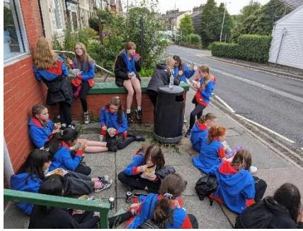
Our annual 'chippy walk