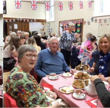
Full to capacity