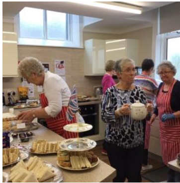
Preparation in the kitchen

But we didn't disappoint. Everyone was served and we celebrated in style, which included a cheeky glass of wine, as we toasted to the new King . . . and we even stood to attention as we sang the National Anthem. Definitely a day to remember!