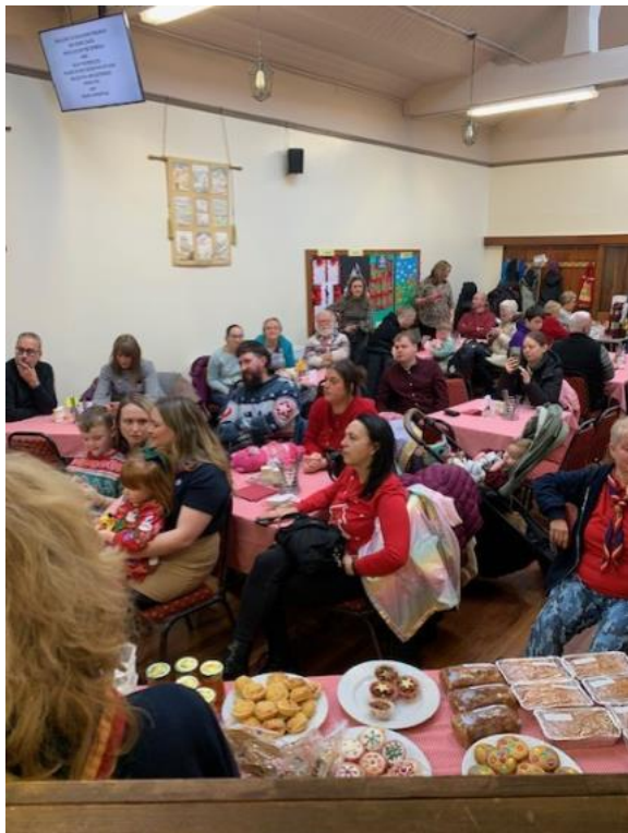
Our Advent Brunch was extremely well attended, and raised £1,000