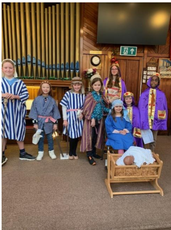
Church was full at our Sunday School Nativity