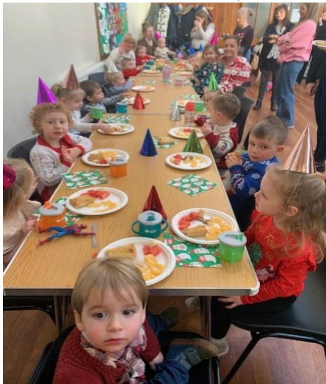
Our Toddler Group Party was enjoyed by both children and adults